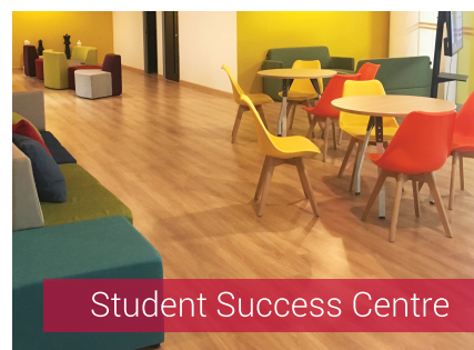
Student Success Centre