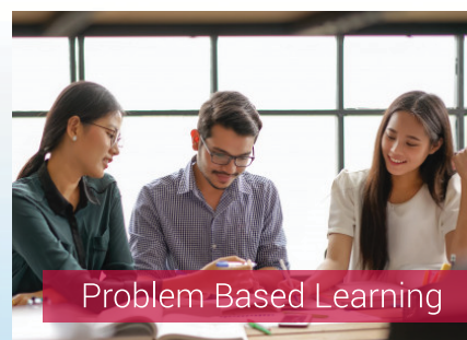
Problem Based Learning