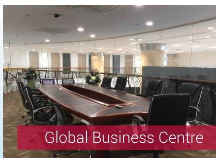
Global Business Centre